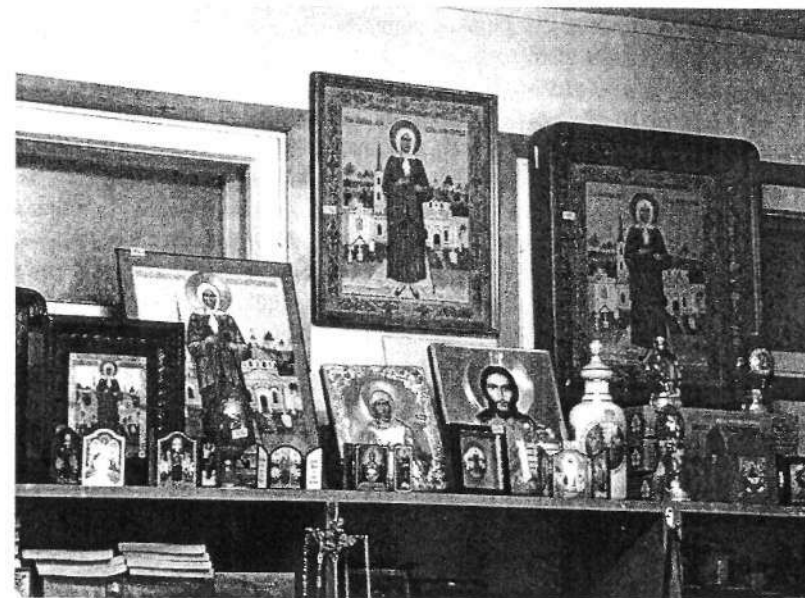
Illustration 9.2. Icons in a church shop at the Smolensk Cemetery.

Among more than 70 holy images of St. Xenia collected by worshippers of the saint on the web site www.xenia-spb.narod.ru , 23 only one icon depicts Xenia in her husband's military uniform. 24 The Church (if one can