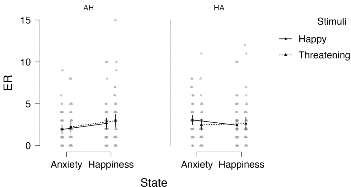
Fig 4. ER for all type of stimuli separated by sequence of mood inducing

As can be seen from the table, we found the significant interaction between factors emotional state and emotional type of stimuli for ESE as ER and between factors emotional state and the sequence of mood induction for ER. Figure 4 shows ER for all types of stimuli separated by the sequence of mood induction. It is noticeable that there are two different tendencies. When anxiety was the first induced state, participants made more errors in happiness than in anxiety, but when happiness was the first induced state, the number of errors was lower in congruent emotional states (Table 5).