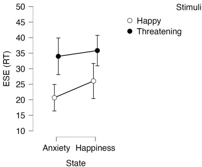
Fig. 3. ESE as RT Difference (ms) in Happiness and Anxiety.