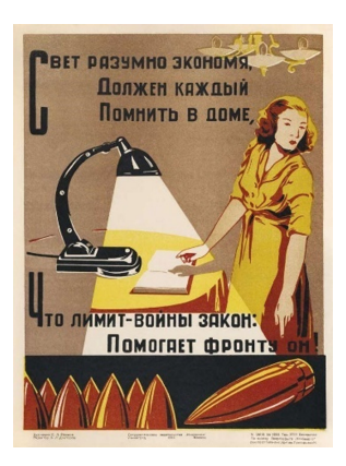
Fig. 3. Save electricity (light)