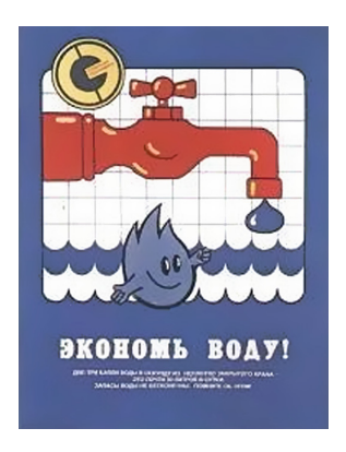
Fig. 4. Save water

People went to food stores with their own bags, in most cases reusable string bags (avoska) due to the lack of disposable plastic bags. The word "avoska" comes from the Russian adverb "avos", which means some expectations "what if" or "perhaps". The term appeared during the time of deficits of consumer goods in the USSR. In 1970, a popular Soviet comedian, Arkady Raikin presented the bag to the audience with the words: "And this is a what-iffie. What if I found something to buy...". The avoska was a representative cultural phenomenon of Soviet routine and could be traced in Soviet films such as "Diamond Arm" (1969). The origin of this bag goes back to Czechoslovakia in 1920. Usually blind people wove string bags at the enterprises of the All-Union Society of the Blind in the USSR. The standard string bag is woven in 14 rows of 24 cells and can withstand the maximum load of 70 kg. [24]. With the popularisation of plastic bags, avoskas gradually fell into disuse, but recent environmental trends in support of banning plastic bags have revived them [25].