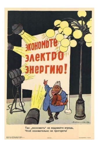
Fig. 2. Save electricity

"Reuse" was a popular concept of Soviet times: every woman knew how to sew, knit and the approach to different fabrics and materials which corresponded to modern DIY slogan. Knitted items were easily modified and turned into new combinations (upcycling and downcycling).