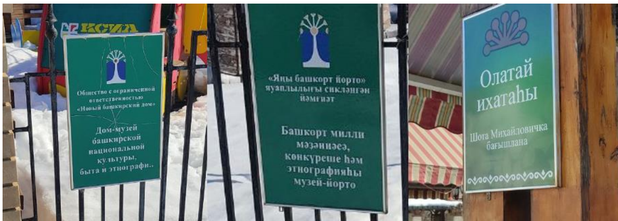
Figure 2. Bashkir signs in the Ethnic Village (Kuznetsov 2023)

On the fence of the “Tatarstan” restaurant (the name is written in an “oriental” font) there are advertisements for business lunches and Chuvash beer (in Russian), and nearby there are two signs saying “House-Museum of Tatar Culture, Way of Life and Ethnography” in Russian and Tatar (Figure 1).