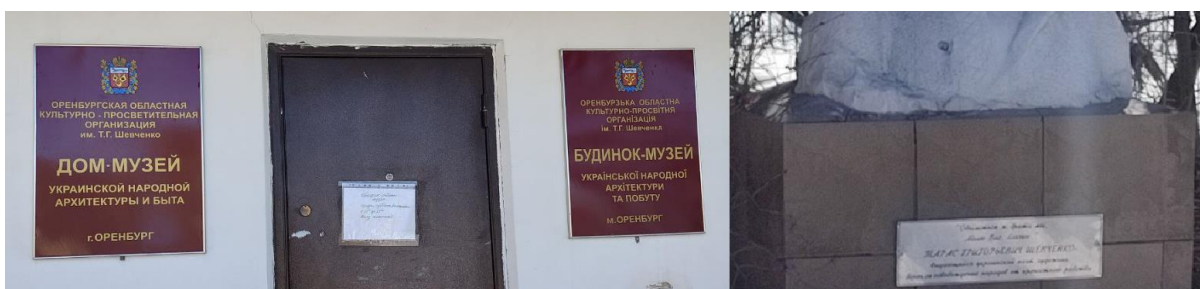
Figure 4. Ukrainian signs in the Ethnic Village (Kuznetsov 2023)

On the fence of the Mordvin yard there are two extremely faded signs. One features a flag of the Republic of Mordovia (Russia) and the Orenburg Oblast with the bilingual Russian and Erzya text “ Mordvin yard ”/” Erzya-Moksha yard ” (Figure 3). Since the sign has faded to the point of being illegible, here is a photo of the same sign from 2014 (Figure 3, photo from foursquare.com). Here one can see that there used to be a Mordvin ornament on the sign. On the second sign on the right there is a text presumably in Erzya, but due to fading it is difficult to recognize.