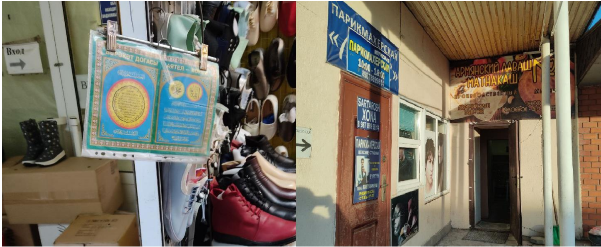
Figure 12. Tatar and Uzbek at the market (Kuznetsov 2023)

In the first case, the author of the sign hung the prayer for themselves, being basically in a private space. The inscription “barbershop” with a telephone number in Uzbek is an appeal to the Uzbek-speaking intended viewer, a portal into a more closed, private community.