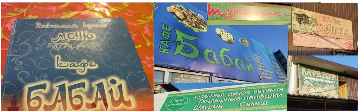
Figure 13. “Oriental” fonts in the designs of Asian and Eastern cuisine restaurants (Kuznetsov 2023)

In general, the linguistic landscape of the market is also almost entirely Russian. However, in ethnic cuisine restaurants, “oriental” font and style are actively used in the names and designs (Figure 13). The same can be seen in eateries near the mosque (Figure 14).