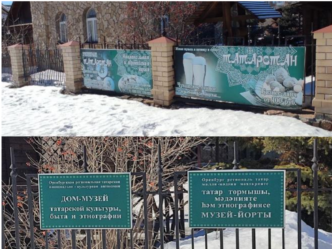
Figure 1. Tatar signs in the Ethnic Village. (Kuznetsov 2023)

On the fence of the “Tatarstan” restaurant (the name is written in an “oriental” font) there are advertisements for business lunches and Chuvash beer (in Russian), and nearby there are two signs saying “House-Museum of Tatar Culture, Way of Life and Ethnography” in Russian and Tatar (Figure 1).