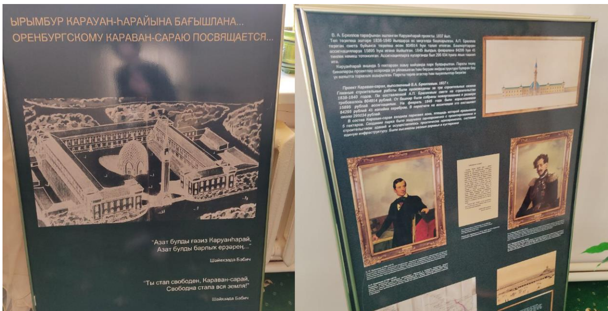
Figure 8. Bilingual Bashkir-Russian stands inside Caravanserai (Kuznetsov 2023)

Inside the building there is a graphic exhibition about the history of Caravanserai and the Bashkir community of Orenburg, made in Russian and Bashkir (Figure 23).