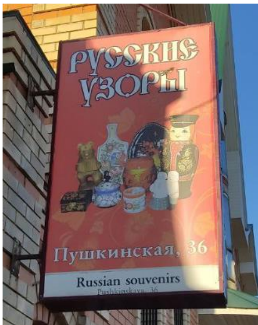
Figure 17. Souvenir shop – Instrumental use of English (Kuznetsov 2023)

Only once there was a sign with an intended foreign viewer – it was a souvenir shop (Figure 17). This may be due to the city's weak tourist capacity, especially for foreign tourists.