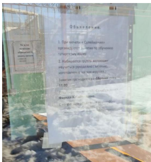
Figure 10. Tatar language classes advertisement (Kuznetsov 2023)

In another Tatar mosque, Suleymaniya (Сулеймания), according to the deputy imam, “ the only non-Russian language thing is the Quran in Arabic ”. Interestingly, at the entrance there were Russian printed announcements about enrollment in Tatar language classes (Figure 10).