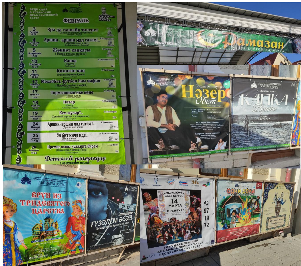
Figure 6. Tatar Theater posters (Kuznetsov 2023)

The city operates the Orenburg State Tatar Drama Theater named after. M. Fayzi (Татарский Драматический Театр им. Файзи), also known as the “Tatar Theatre”. On its walls and nearby one can find perhaps the largest concentration of the Tatar language in the city – on posters (Figure 6).