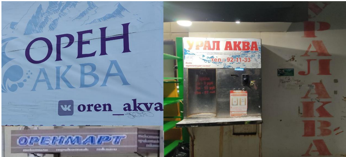
Figure 18. The use of local brand (Kuznetsov 2023)

The borderland element and references to Kazakhstan, are practically absent – only twice did we come across shops with sweets from Kazakhstan (Figure 19).