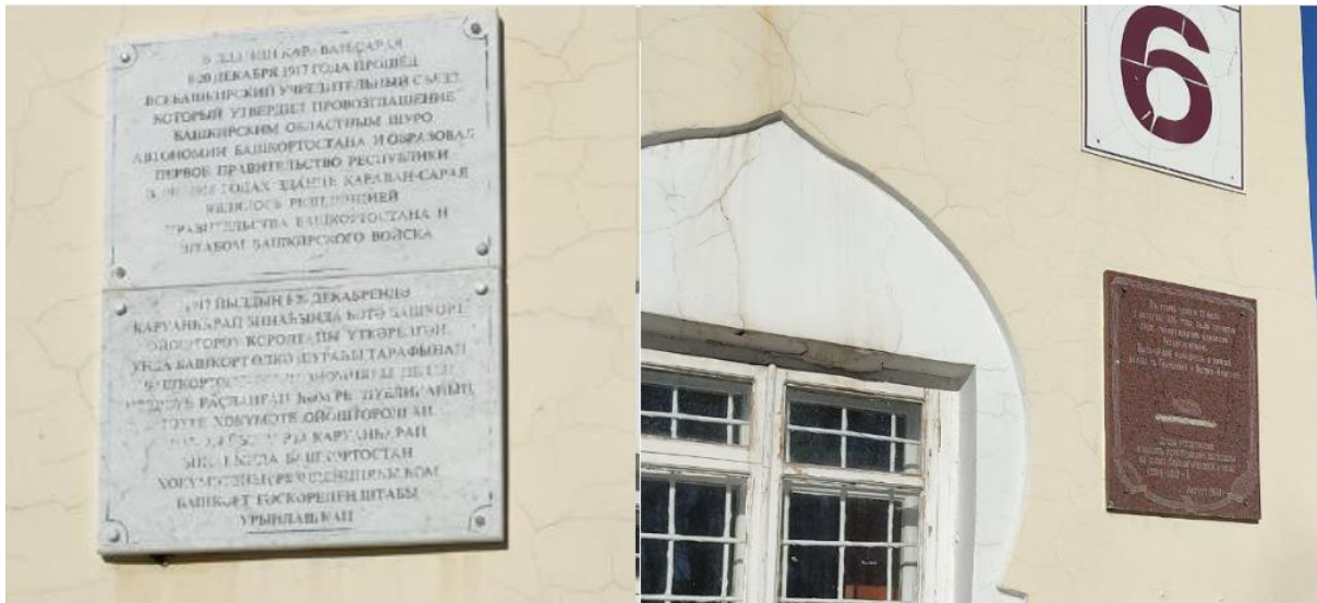
Figure 7. Signs on Caravanserai

The next place worthy of attention is the Bashkir cultural centre and prayer house “Caravanserai”. Outside the building there are several signs with Russian texts dedicated to the history of the place (Figure 7). One of them is duplicated in the Bashkir language.