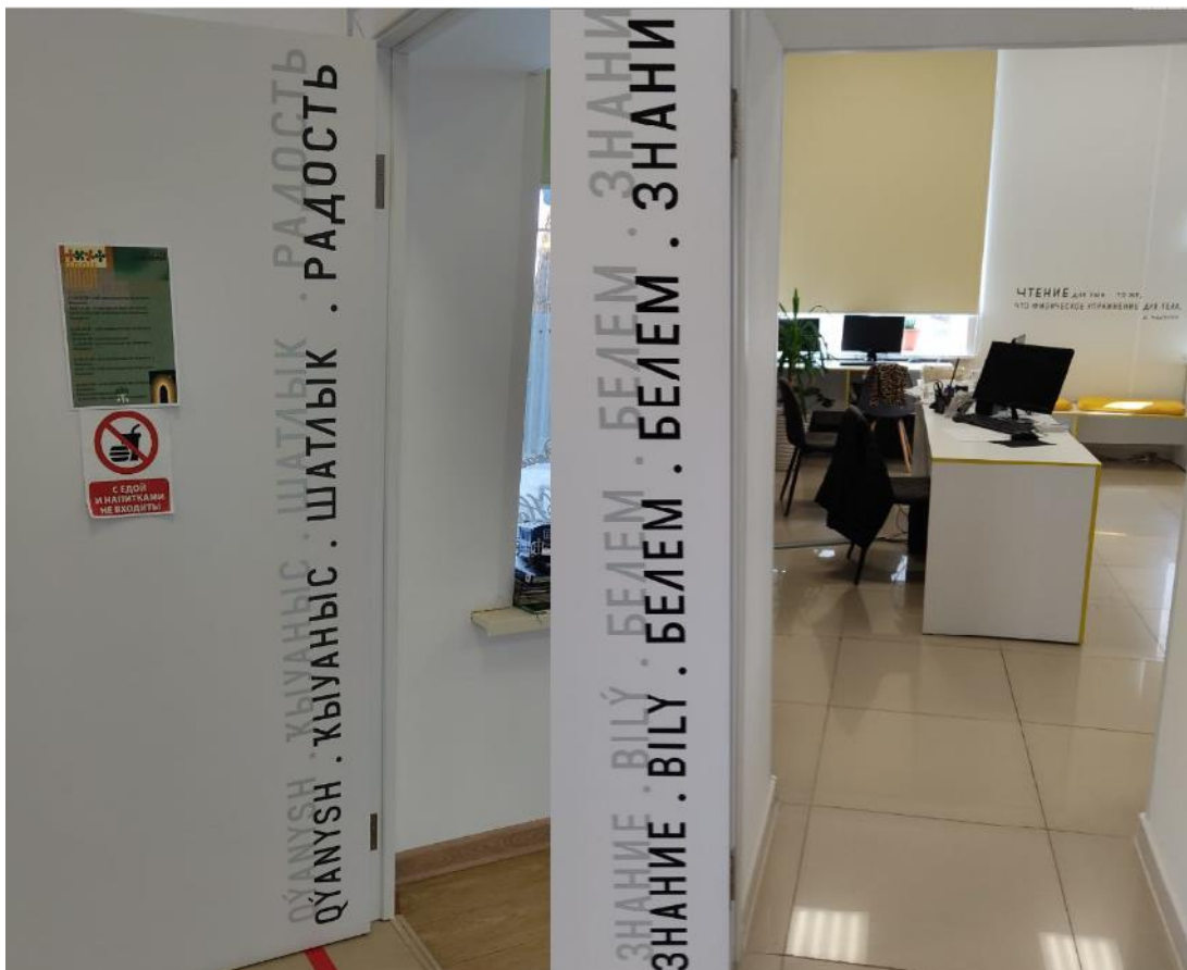
Figure 5. Kazakh, Bashkir, Tatar and Russian signs in the Tatar Library

There is a Library named after Kh. Yamashev (Библиотека им. Х. Ямашева), also known as the “Tatar Library”. As noted, it acts as a cultural and educational centre for the Tatar, Bashkir and Kazakh communities.