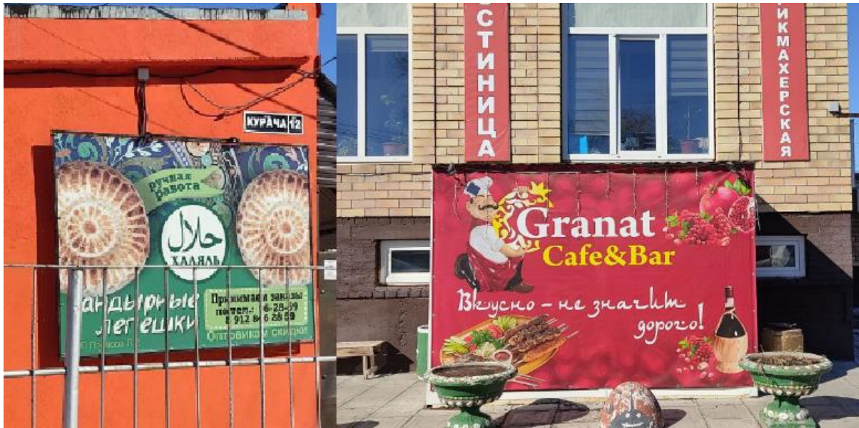
Figure 14. “Oriental” fonts on Eastern Cuisine eateries near the Suleymanya mosque (Kuznetsov 2023)