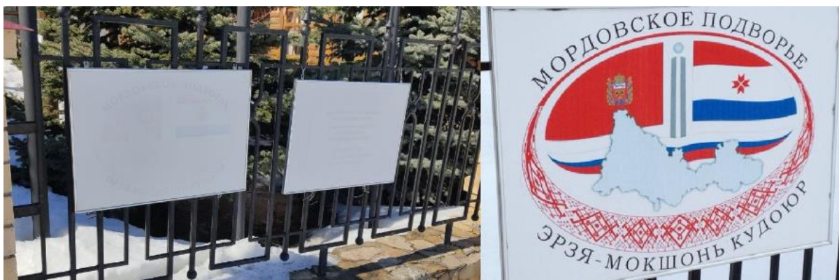
Figure 3. Mordvin signs in the Ethnic Village (Kuznetsov 2023)

On the fence of the Mordvin yard there are two extremely faded signs. One features a flag of the Republic of Mordovia (Russia) and the Orenburg Oblast with the bilingual Russian and Erzya text “ Mordvin yard ”/” Erzya-Moksha yard ” (Figure 3). Since the sign has faded to the point of being illegible, here is a photo of the same sign from 2014 (Figure 3, photo from foursquare.com). Here one can see that there used to be a Mordvin ornament on the sign. On the second sign on the right there is a text presumably in Erzya, but due to fading it is difficult to recognize.