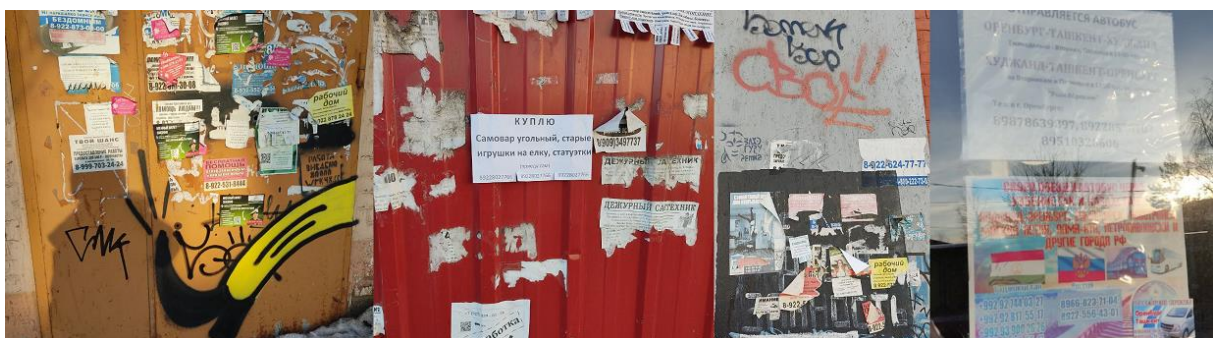
Figure 15. Unauthorised signs (Kuznetsov 2023)

Notice boards, handwritten announcements, graffiti and unauthorised signs encountered by the author in Orenburg were entirely in Russian (except for the only one in Uzbek) (Figure 15). The announcements at the market pertaining bus transfers to Central Asia, targeted primarily at labour migrants were in Russian as well (Figure 15).