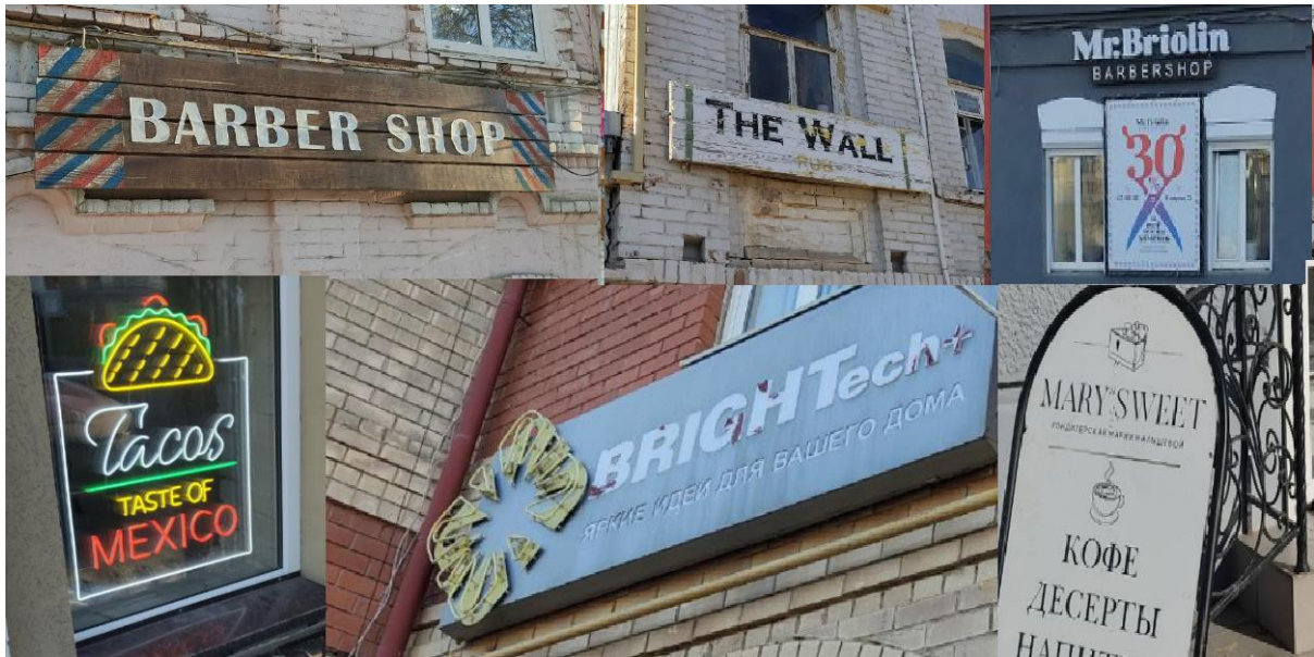
Figure 16. Symbolic use of English in LL (Kuznetsov 2023)

Only once there was a sign with an intended foreign viewer – it was a souvenir shop (Figure 17). This may be due to the city's weak tourist capacity, especially for foreign tourists.