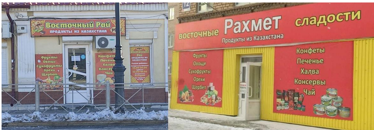
Figure 19. Kazakhstani food shops (Kuznetsov 2023)

The borderland element and references to Kazakhstan, are practically absent – only twice did we come across shops with sweets from Kazakhstan (Figure 19).