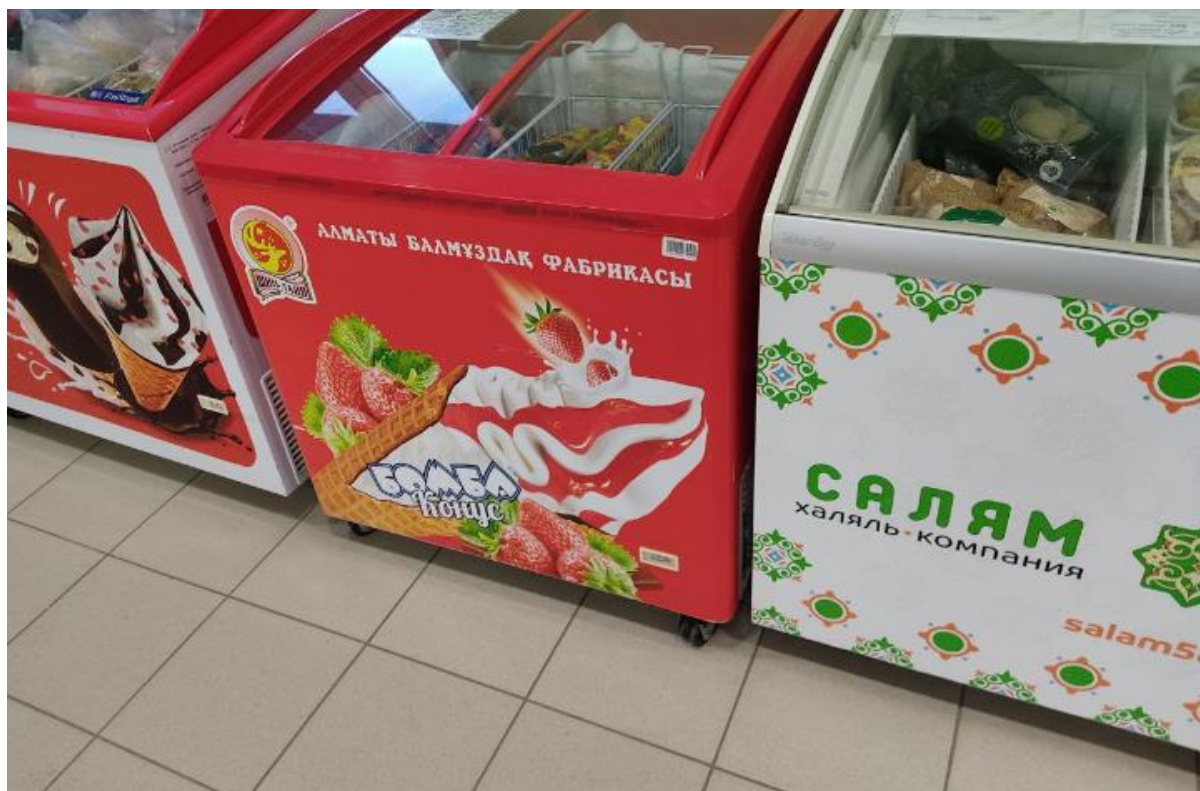
Figure 20. A refrigerator from Kazakhstan (Kuznetsov 2023)

Kazakhstan) was seen once in a halal food store (Figure 20). Two times, we saw Kazakhstani food shops.