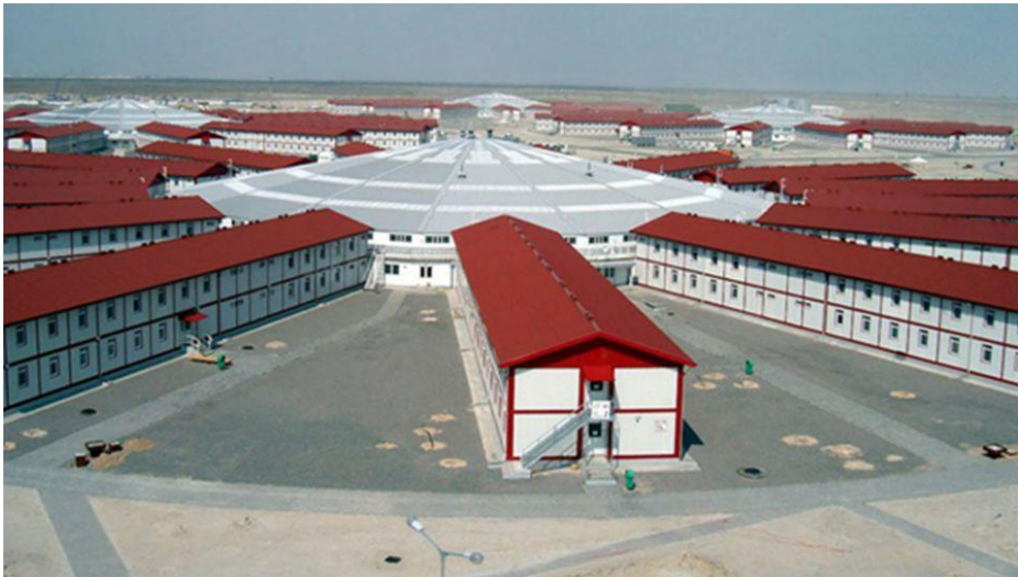
Fig. 2. Example of rotational working settlement «Tengiz» with atrium

shape with residential areas (living cells) disposed in modular block containers connected to a central building of cylindrical shape (fig 2). The deep plan of the cylindrical building has limited connections to the outside, i.e. limited façade area, which imposes restrictions in terms of its internal layout. The mix of internal activities needs to be distributed considering limited façade availability, reducing options for community spaces which require connections with external views and daylight, such as for instance green spaces. It potentially imposes the use of a central atrium as a fixed internal layout design feature to guarantee daylight and sunlight to the inner parts of the ground floor.