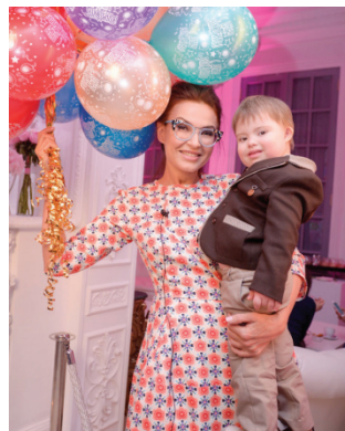
Figure 8: Famous actress and blogger Evelina Bļodans often publishes family photos with her son with special needs

At the same time, an emergent code of culture is a thoughtful fatherhood code, where a man can become a houseman, raising children, or thoughtfully sharing parenthood duties with a woman. A baby-food brand “Agu-sha” has released a TV-ad with the song “Dad is around”, where famous and successful actors who are young fathers spend the whole day with their babies singing lullabies to them.