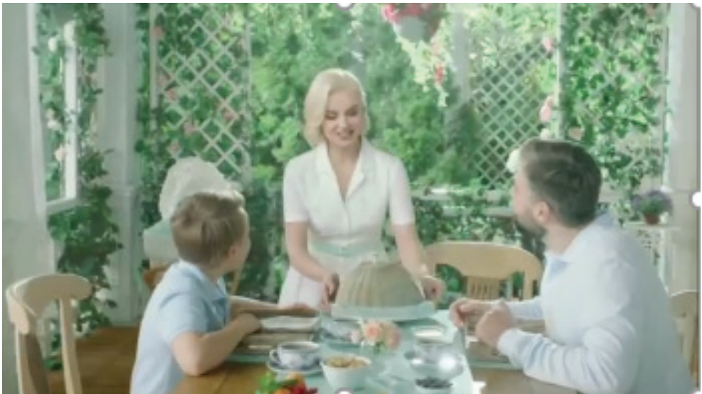
Figure 4. Danone yoghurt TV commercial. 4

Alongside a workaholic, there existed and still exists another image, that of a Perfect Hostess demonstrating self-realization of a woman as focusing only on family and the desire to please her husband and household. She doesn’t have any hobbies and other interests besides family, she doesn’t build a career (at least we don’t know of it). Her context consists of a kitchen and a living room, where she serves dinner for the whole family. She is always beautifully dressed, and in a good mood. She has a traditional family, in which the man works, and they have an adorable kid/kids (fig. 4).