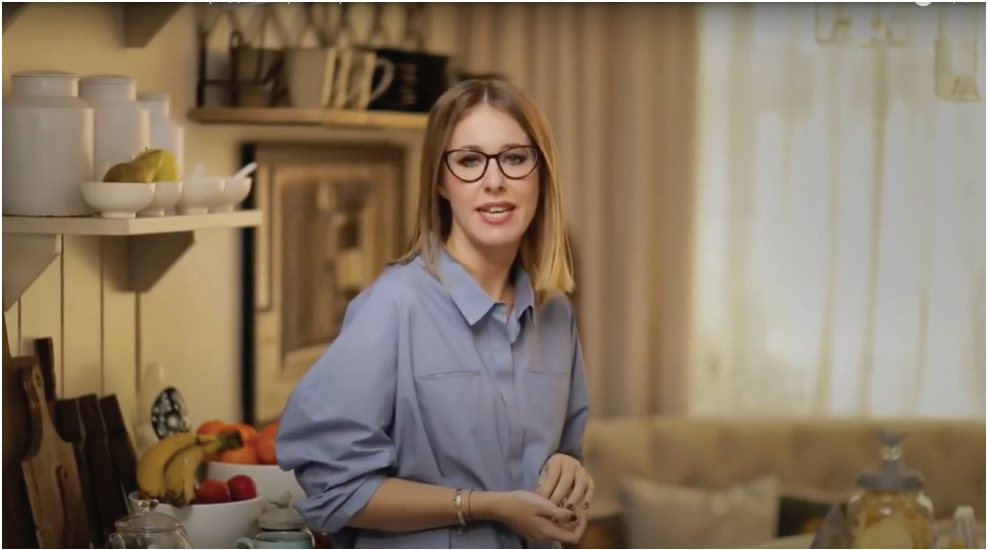
Figure 6: X. Sobchak's campaign commercial for presidency, 2017-2018.