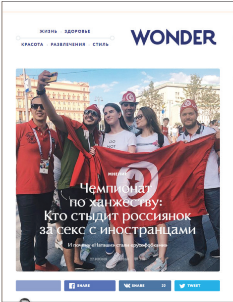
Figure 1: Wonderzine article “Bigotry World Cup: Who is shaming Russian women for sex with foreigners?” 1