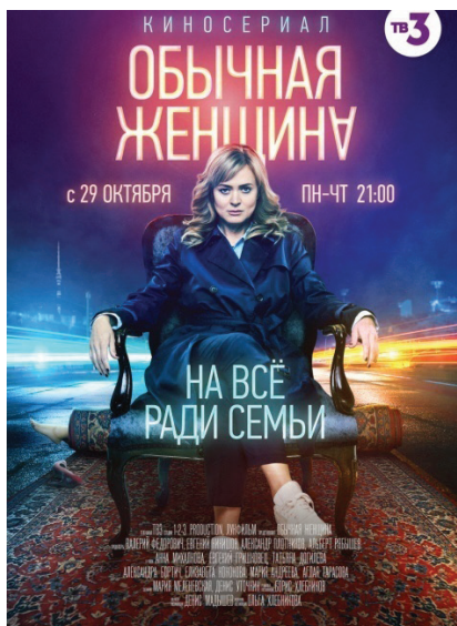
Figure 5: “An ordinary Woman” Series (2018).

What are, then, the dominant codes regarding self-realization? One of them is a code of Hostess-Superhero. It consists of an image of a contemporary Russian woman, who “would enter a burning house and would stop a stampeding horse” in the words of a famous Russian poet Alexey Nekrasov. The same goes for the Perfect Hostess, because for this very woman her husband and her family are the most important things in life. But, unlike the previous Hostess-Superhero, she does not hide behind her husband’s back. Indeed, it is her husband who feels safe behind her back. She does not look perfect, rather more realistic and, again, she has no regard for herself, she does not have her own wishes or interests. This code is aptly demonstrated in the song “Not a Paris” by Russian band “Leningrad”. 5 This image can be found in a TV-series which became very popular in Russia with the ironic title “An ordinary woman” (2018), starring Anna Mikhalkova. This series portrays the life of a 39-year-old married Russian woman, who is pregnant with her third child. While her husband serves high ideals as a doctor, and, at the same time, cheats on her, Anna starts an illegal and dangerous business, in order to protect her husband from the mafia, and earn money for the whole family (fig. 5).