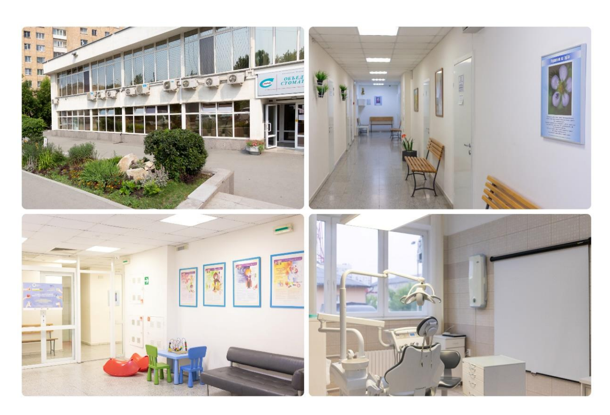
Figure 2. Environment of the government dental clinic.