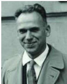
Vladimir Abramovich Rokhlin

mod 4 used there can be refined as \chi(F) - \sigma(X) \equiv 2\tau(F) \pmod{8} , where \tau(F) is the residue modulo 4 that can be described by the location of the surface F in X . In particular, it can be calculated for Arnold's surfaces in \mathbb{C}P^2 , which leads to the congruence p - n \equiv k^2 \pmod{8} . In this case, the proof of the congruence \chi(F) - \sigma(X) \equiv 2\tau(F) [in contrast to the proof of the congruence containing the Arf-invariant from §3 of my note] is quite elementary. No covers are needed.