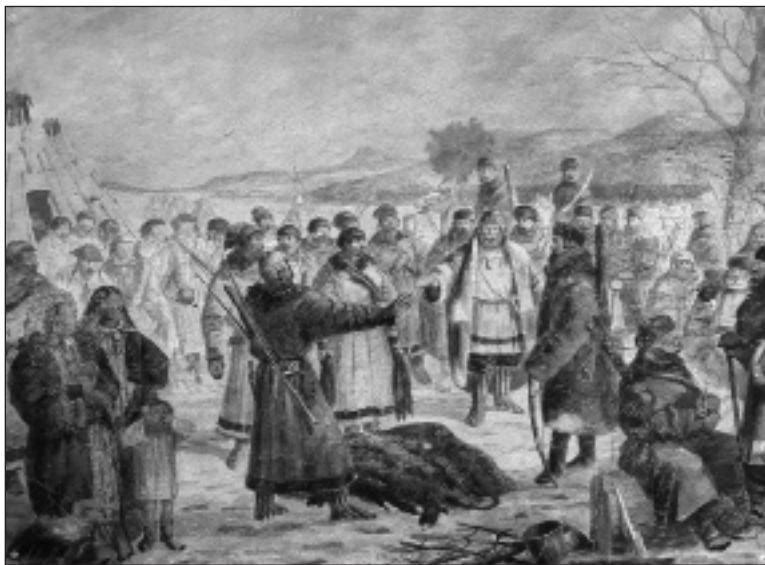
This nineteenth-century watercolor by an unknown artist shows Cossacks from the Yenisei River collecting yasak in the form of animal pelts, presumably from indigenous Siberians (perhaps Sel’kups).

These nomads, who were here today but there tomorrow, were not that easy to find. It is quite common to read that the yasak people could not be found in the same feeding place the following year: “we are nomads, not settlers, we go and live wherever we want” is what they said about themselves. They returned to pay yasak irregularly and whenever they wished, as the Berezov yasak book says about the Kazym and Obdorsk Samoyeds. “And it is impossible to find them, the Berezov people, in the