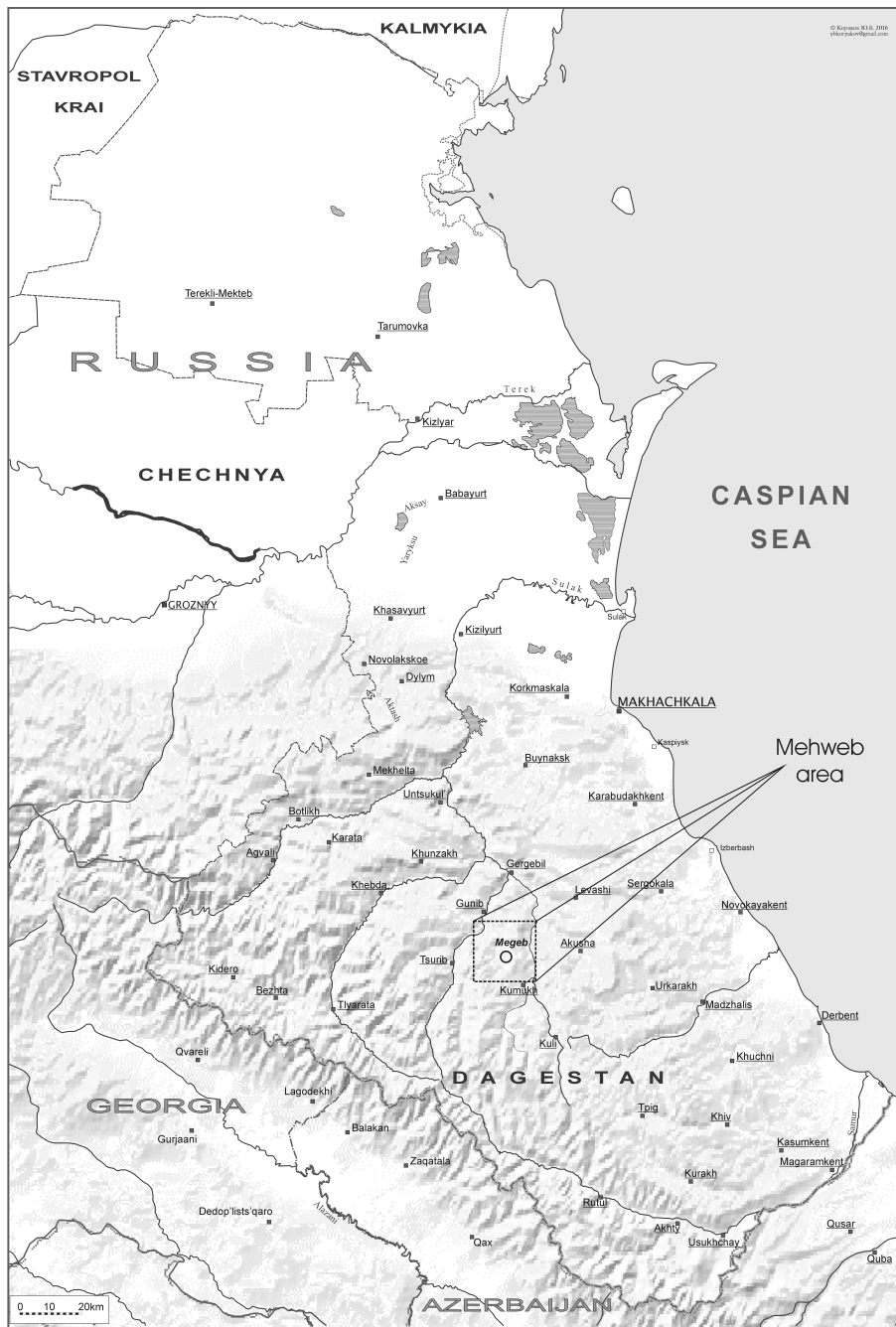
Figure 2: Mehweb on the map of North-East Caucasus