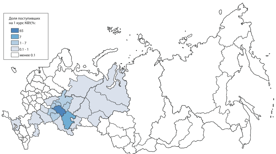
Pic.2 The geography of students of Kazan Federal University, 2015-2017 years