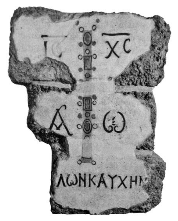
Fig. 2. Crux gemmata with the inscription ἀποστό]λων (or [ἀγγέ]λων) καύχημ[α. From H. Cotton, W. Ameling et al. (eds.), Corpus Inscriptionum Iudaeae/Palaestinae. Vol. II: Caesarea and the Middle Coast (Berlin, New York 2010), 81

Among the plaster fragments found scattered on the first floor of what was presumably a two-floor hostel (fragments which, as Di Segni and Patrich believe, probably come from the upper-floor 'chapel')<sup>5</sup> also belongs another, larger, piece of plaster with a painted crux gemmata (about one meter high) (Fig. 2); there were at least three such crosses in total painted on the walls of what Patrich and Di Segni would see as an upper-floor room. Right below the cross was another inscription, which has also survived in the debris of Building 1: \Lambda\Omega NKAYXHM. According to Di Segni's interpretation (which I find entirely convincing), it contains a liturgical invocation to the cross of the type ( \sigma t \alpha \upsilon \rho \delta \varsigma ) \mu \alpha \rho \tau \delta \rho \upsilon \omega / \dot{\alpha} \sigma \sigma \tau \delta \lambda \omega / \mu \upsilon \alpha \zeta \delta \upsilon \tau \omega \tau found in a number of pseudo-Chrysostomic homilies.<sup>6</sup> The devotional space of the chamber (be it an upper-room chapel or otherwise) was dominated by large images of jeweled crosses embellished with liturgical invocations informed by homiletic diction.