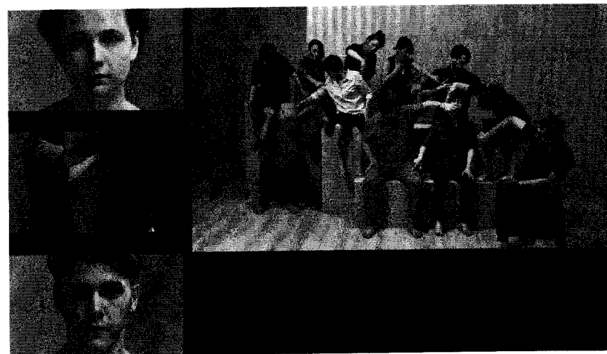
Figure 12.1 Chto Delat, still from The Excluded .

In this way, the public and the intimate are suspended in tense, dialectical interplay. Each approach to the threshold of violence re-founds the alternative institution and, most importantly, invites others to join its intimate practices.