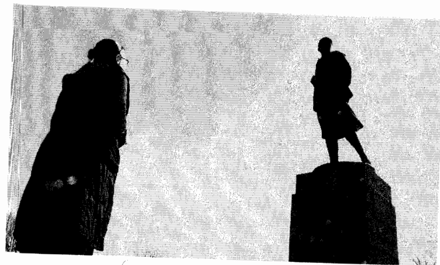
Figure 12.5 Chto Delat School of Engaged Art (directed by Natalya Pershina-Yakimanskaya/Gluklya), still from Looking for Zoya, II .

making decisions, anticipating a future of meaning (what our life 'will have meant'), all based on the internal directedness of our activity. But the future of meaning can only exist outside our horizon – in the past, as perceived from the perspective of an encircling, consuming gaze. This contradiction can be a source of both freedom and alienation, since the final meaning of my life and actions can and must always be deferred. You cannot tell me who I am and what my life means until all my inner force is exhausted. The meaning of 'my' life is never really mine, since it is ultimately only accessible from a position beyond my death (Bakhtin 1990).