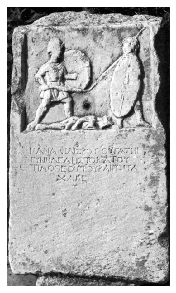
Fig. 3: The stele of Nana: photograph by I. Luckert, from E. Pfuhl & H. Möbius, Die Ostgriechische Grabreliefs, ii (Mainz: Von Zabern, 1979), Taf. 189 Nr. 1273.