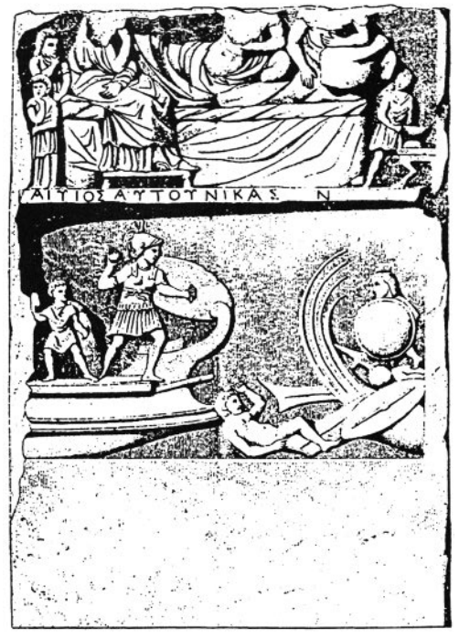
Fig. 4: The stele of Nikasion: (a) upper part; (b) lower part: drawings from P. Le Bas et al., Voyage archéologique en Grèce et en Asie mineure: Planches de topographie, de sculpture et d'architecture (Paris: Firmin-Didot, 1888), pl. 131. 1 and 2.