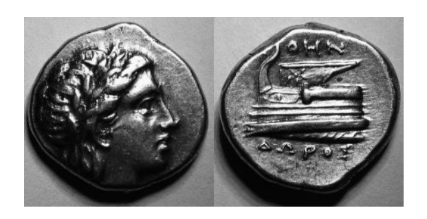
Fig. 5: Coin of Cius (second half of fourth century): photograph from Tantalus Online Coin Registry, S/N 37110.