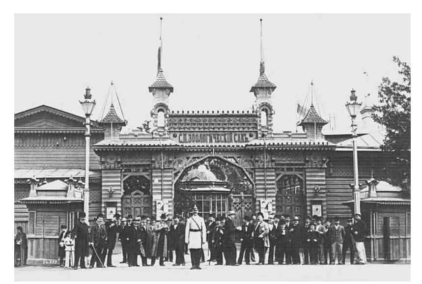
Figure 1. Photograph of St. Petersburg Zoological garden. c. 1910.