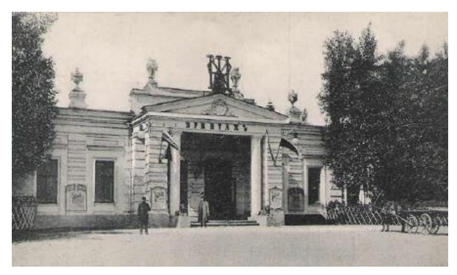
Figure 3. Photograph of the entrance to the Moscow Hermitage pleasure garden. c.1910.

attractions and devices that, for example, produced electricity, allowing these entrepreneurs to proclaim that their achievements were close to those of Europe. Audiences sometimes attended pleasure gardens to learn about technical inventions. At the Moscow Hermitage (Figure. 3), for example, its owner Yakov Schukin, a former peasant who became a merchant, did his best to make his garden a modern and lucrative resort. He travelled to Europe at least twice and attended the top theatres, pleasure gardens and amusement parks in Berlin, Vienna, Budapest, Paris and London to learn about their programmes, novelties and technological advances. He signed a contract for an autonomous diesel electric station for his garden, one of the first diesels in Moscow, which was used to generate enough electricity to illuminate his garden perfectly and the included the construction of a heating system there. In addition, Schukin purchased a special mechanism that would allow him to water all the plants in his garden simultaneously. Of course, signing contracts with foreign stars like Harry Houdini and Sarah Bernhardt were just as important to him.