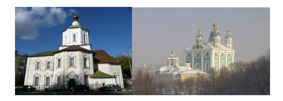
The church of Otroch monastery in Tver' (left) and cathedral of Smolensk (right)

The main church of Otroch monastery in Tver' (1722) was also formed by superimposed octagonal volumes. They are surrounded by three relatively high foils and by unusual two-tier trapeznaya from the west side. Trapeznaya was a kind of vestibule used sometimes also for church services and was generally much lower than the core of the church. I can suppose, that this composition was created by the ktitor of the church Ukrainian metropolitan Sylwester Chołmski-Wołyniec following the example of Ukrainian basilica churches such as Trinity cathedral in Chernigov (1679–1695). The biggest basilica of this kind in Ukraine was the Dormition church of Kiev Pechersk lavra. In years 1722-1729 the enormous western volume was added to the late 11th century building, and six new cupolas were added to the existing one. The influence of this model can be assumed in Dormition cathedral of Smolensk. This construction of this immense building started in 1677, but the church remained unfinished even in the early 18th century (Vdovichenko 2009). Only in 1730th the Ukrainian metropolitan Gedeon Wiszniewski restarted the building process and consecrated the cathedral in 1740. Some unusual features of this cathedral, first of all the setting of seven domes (only five remain now) can be explained only by the desire to reproduce some iconographical details of the sacred Kievan model.