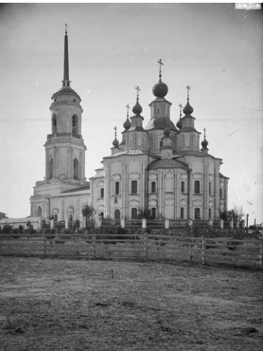
Cossacks' cathedrals in Starocherkassk (left) and Dubovka (right)

This fact is not as astonishing as it seems, bearing in mind immense distance that separates Siberia from Ukraine. In fact, Siberia was some kind of depository of Ukrainian architectural forms in Russia during the whole 18th century. The subject has been already studied (Maciel 2003 and 2011), and I give here only the brief outline. All the metropolitan of Siberia between 1700 and 1768 were Ukrainians. In the 17th century only a couple of stone buildings has been built in Siberia, so the region was lacking own architectural tradition. Many bricklayers came in the early 18th century from Moscow, Yaroslavl and Urals, carrying out commissions from Moscow government. They were rarely on disposal of clergymen, and Ukrainian metropolitans invited to Siberia their own building teams, which remained here for a long time and worked until 1750th. The most important of their buildings, such as Trinity monastery cathedral in Tiumen' (1709–1715), became models for future Siberian churches and promoted survival of Ukrainian architectural features in Siberia until 1790th and even in deeply conservative wooden architecture, for example, in the Annunciation church in Verkholensk (1795–1804), now in Irkutsk province.