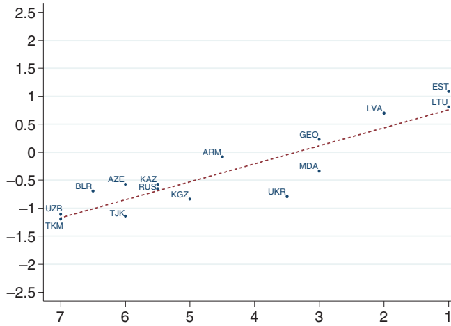
Figure 1. Democracy/autocracy ( x -axis) and quality of institutions ( y -axis) in post-Soviet countries. Legend: ARM – Armenia; AZE – Azerbaijan; BLR – Belarus; EST – Estonia; GEO – Georgia; KAZ – Kazakhstan; KGZ – Kyrgyzstan; LTU – Lithuania; LVA – Latvia; MDA – Moldova; RUS – Russia; TJK – Tajikistan; TKM – Turkmenistan; UKR – Ukraine; UZB – Turkmenistan. Sources: Freedom House and World Government Indicators for the calendar year 2013 (FH (Freedom House) 2014; WGI 2014).

absent in post-Soviet autocracies. This model demonstrates a curvilinear relationship between quality of institutions (axis X) and rent extraction (axis Y). It does not necessarily imply a specific regime type; it is rather a model of desired authoritarian equilibrium based on guaranteed access to economic and political rent. Its focus is the negative correlation between monopoly on economic and political rent extraction and quality of institutions – the higher the rent, the lower the institutional quality. The consequence is that any improvement of the quality