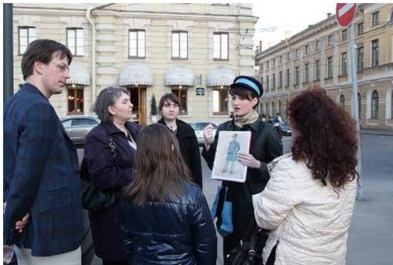
Figure 2. Museum Quarter Excursion with the Postman Guide