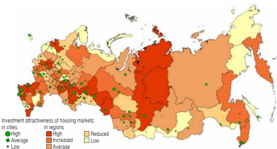
Fig. 2. Evaluation of the investment attractiveness of housing markets in major Russian cities (with a population of over 100,000 people) and regions

3) The most attractive real estate markets are the markets of oil and gas producing regions of Russia because of high incomes. In the post-crisis period (after 2008) many re-