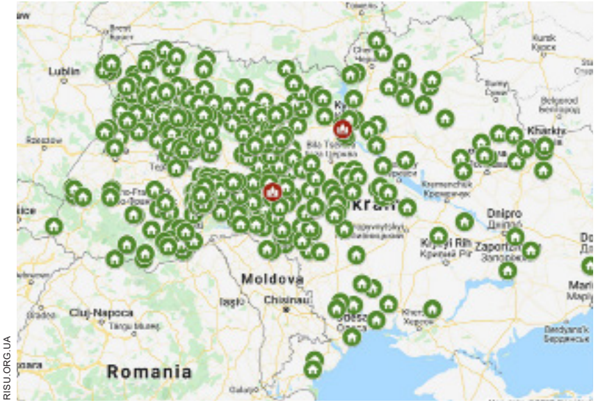
Fig. 6. Activists from Pasechnaya visiting Metropolitan Antony (Makhota) of the OCU to ask for the transfer of their parish despite the opposition of parish members and priest. Fig. 7. Crowdsourced online map of the Ukrainian churches that have changed their affiliation from UOC-MP to the OCU since January 2019.

Orthodox Christians could not really separate the political from the spiritual-sacramental. Very concrete issues came into play, relating to their access to the sacred: being able to bury their family members in the local cemetery, visit other churches and pilgrimage sites and bless their Pascha in church at Easter. Those who decided to join the OCU considered the sovereignty of their church and country, but also the fact that this allowed them to rejoin the Orthodox commonwealth and enter into communion with the other Orthodox Christians. Those who decided to stick to the UOC-MP might have bought into its theopolitics of canonical territory, which counters the nationalism of the Ukrainian state, but they also saw the church they attended as a bulwark of stability and continuity. The arguments on both sides were quite similar, concerned with the truthfulness of their church and rite and coined in the language of communion, canonicity and sovereignty. For them, the continuity of tradition that the Orthodox Church stands for provided a more stable reference in a context of political instability and economic crisis.