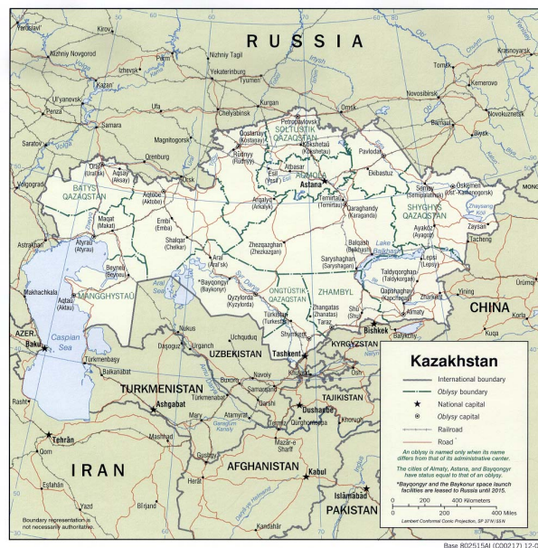
Fig. 1: Major cities of Kazakhstan (currently)

Firstly, it can be observed from the map of Kazakhstan on figure 1 that major cities are situated peripherally, extremely distant from each other and almost all of them were founded during the period of Russian colonialism. Moreover, the level of industrial development, concentration of educational organizations and human capital levels vary largely across the country. Can conventional wisdom explain why some regions of Kazakhstan are thriving meanwhile others have been abandoned? Or was this process predominantly influenced by the history of colonial period?